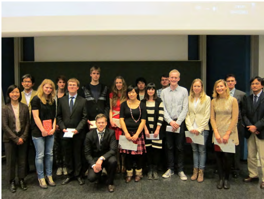
Participants and judges, Speech Contest 2012